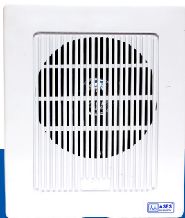
P.A. Wall Mount Speaker